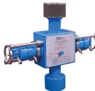
Single Apollo Wireline Valve