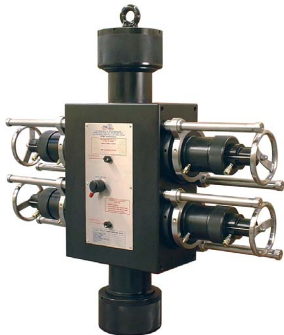
Dual Apollo Wireline Valve Without Protection Frame